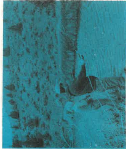
After an exciting day of digging you can relax at one of the fishing spots.