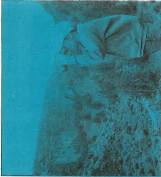
Scenes such as this are common in the agate bed area. A photographer's paradise.